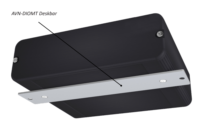
Fig 1-6: Iso View Shown with AVN-DIOMT Deskbar Attached