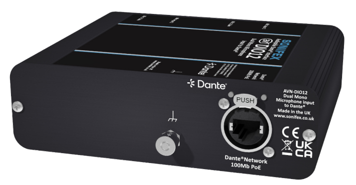
Fig 1-8: AVN-DIO Front Iso View Shown without Accessories

Fig 1-6: Iso View Shown with AVN-DIOMT Deskbar Attached